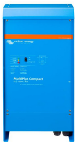
MultiPlus Compact 12/2000/80

And sophisticated software (VE.Bus Quick Configure and VE.Bus System Configurator) is available to configure several new, advanced, features.